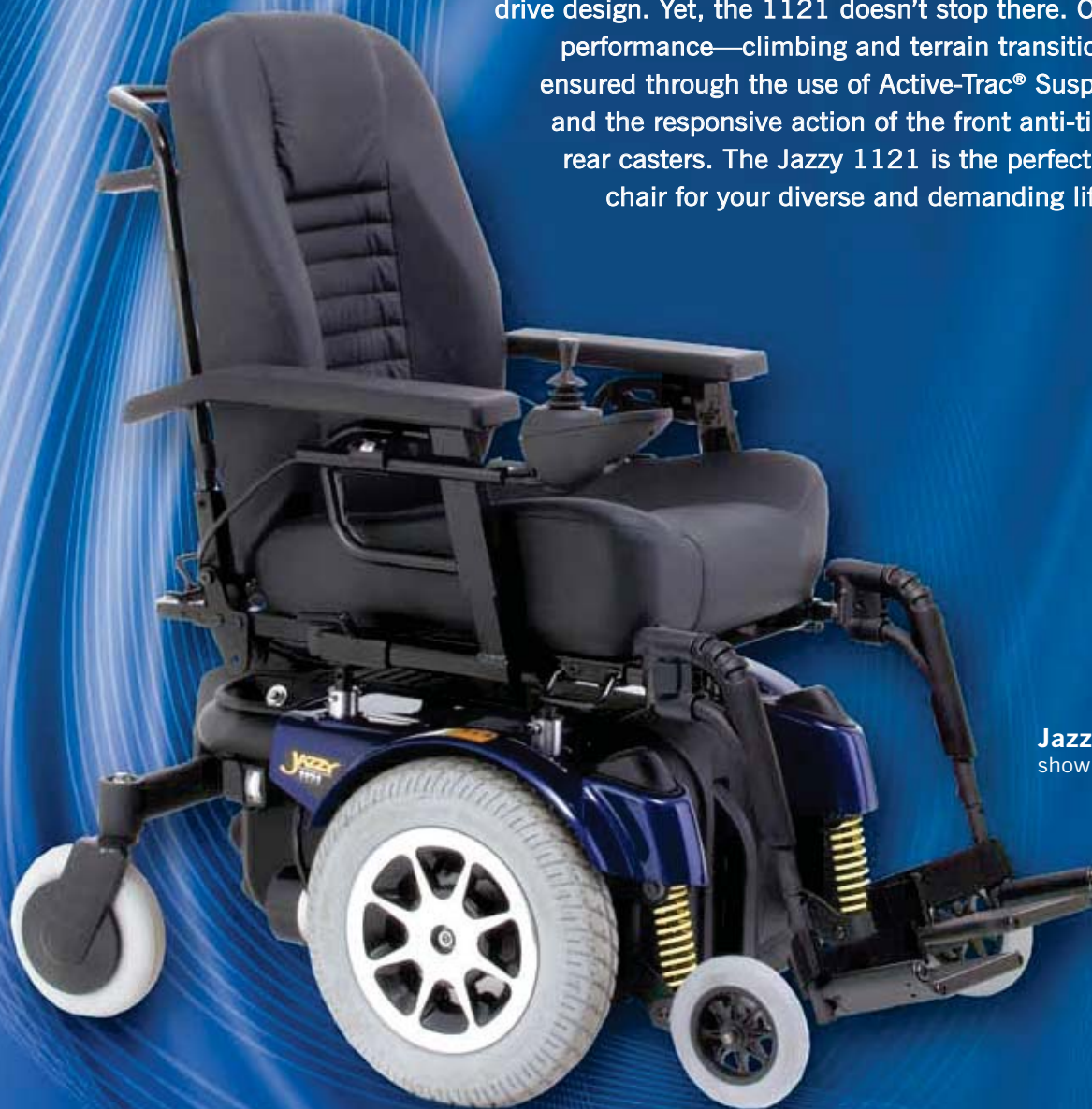
Jazzy® 1121 shown in Blue

Tight-space indoor manoeuvrability is made easy with the Jazzy® 1121's compact overall size and mid-wheel drive design. Yet, the 1121 doesn't stop there. Outdoor performance—climbing and terrain transitions—is ensured through the use of Active-Trac® Suspension and the responsive action of the front anti-tips and rear casters. The Jazzy 1121 is the perfect power chair for your diverse and demanding lifestyle.