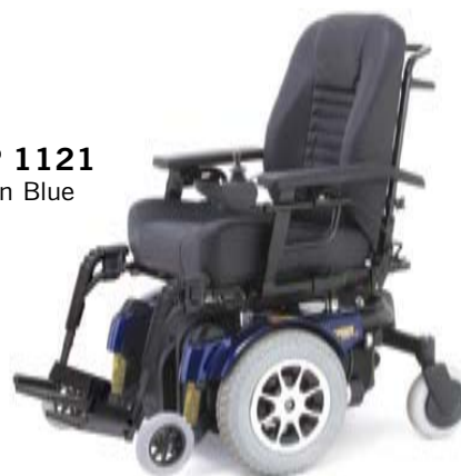
Jazzy® 1121 shown in Blue